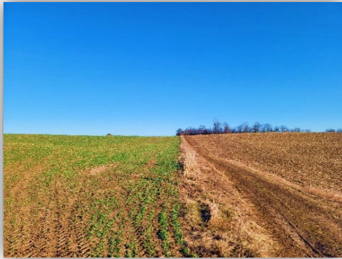
Installing cover crops for soil health and erosion reduction benefits