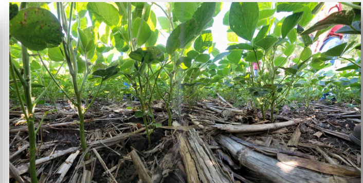
County-Wide effort to reduce tillage and keep more residue on the surface