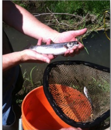
Provide Local knowledge on the status of our streams quality and fish habitat.