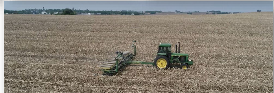
Right: Landowners surrounding the town of Goodhue doing their part to improve soil health and reduce nitrate leeching into the groundwater