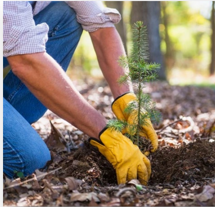
Above: Provide Landowners a Local Source of Trees/Shrubs for planting windbreaks, timber production and areas for wildlife