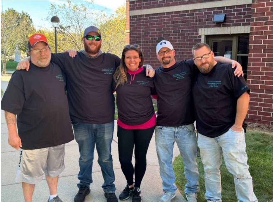
Teannas graduation pic here