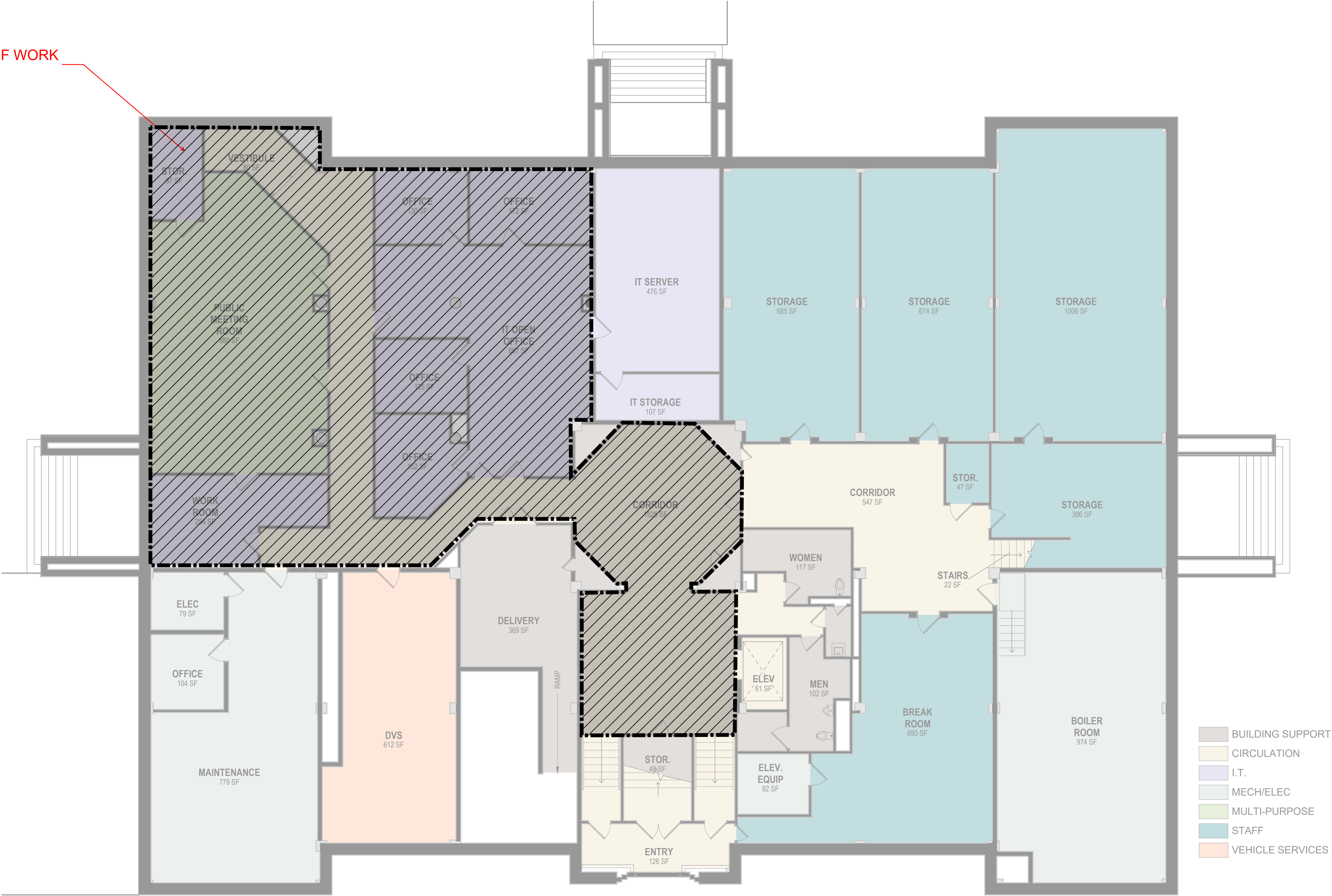
LOWER LEVEL - DEPARTMENT - EXISTING SCALE: 1/8" = 1'-0"