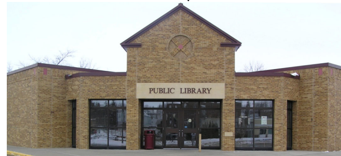
Zumbrota – 46,211