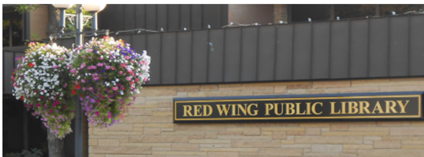
Red Wing – 142,247