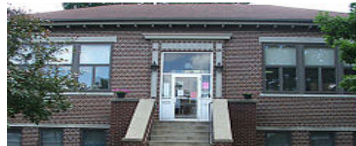
Pine Island – 16,972