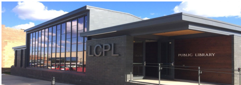
Lake City – 45,485