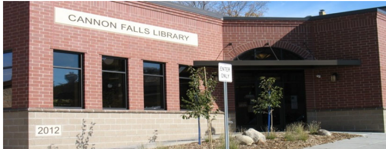
Cannon Falls – 44,247