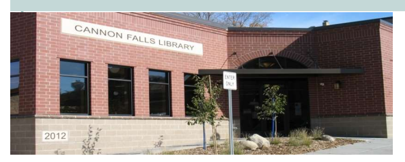
Cannon Falls – 14,539