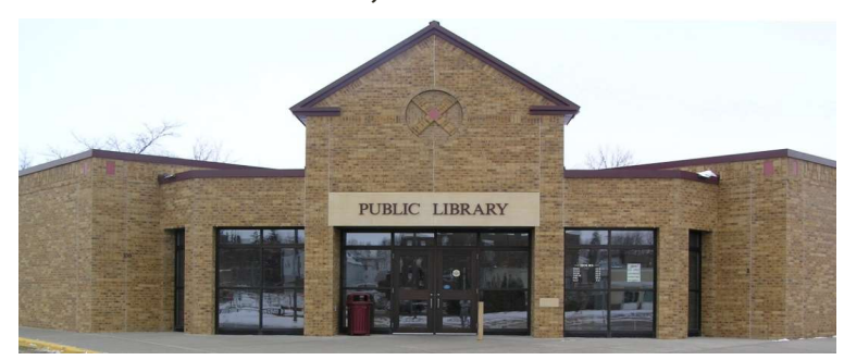
Zumbrota – 23,876