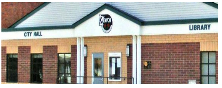
Kenyon – 7,446