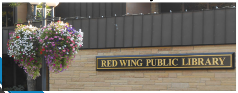
Red Wing – 85,401