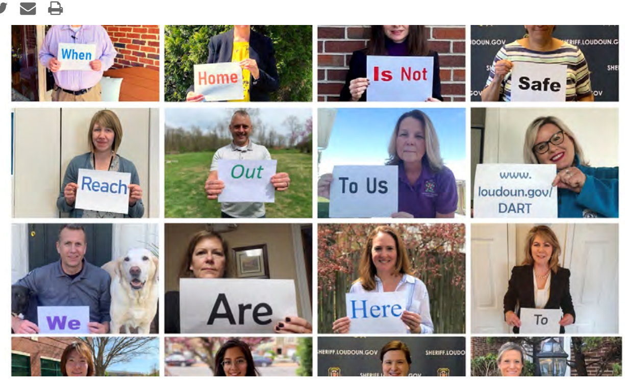
Members of the Domestic Abuse Response Team in Loudoun County, Va. let county residents know they are still available and encourage them to reach out for help during the coronavirus pandemic.