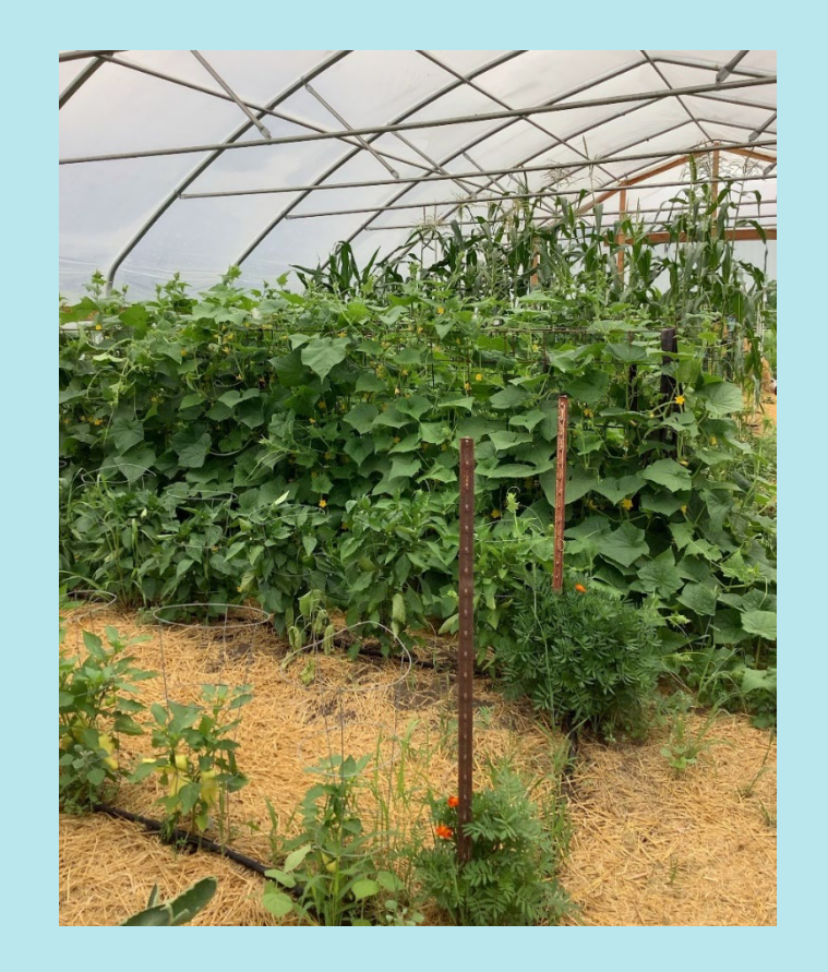
Quiet Waters Ranch