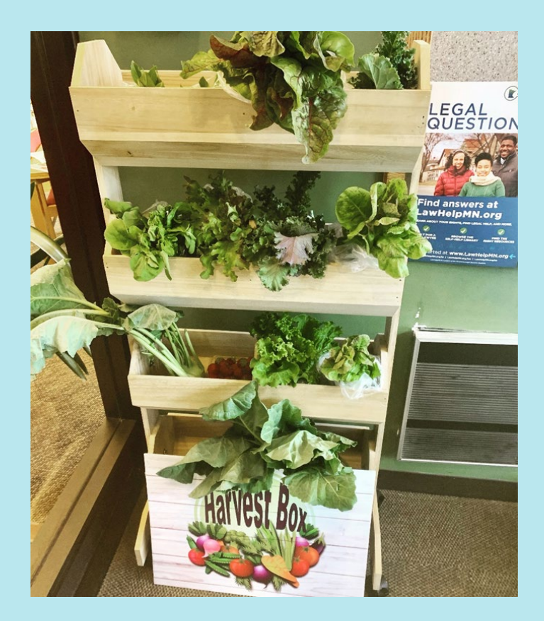
Cannon Falls Library