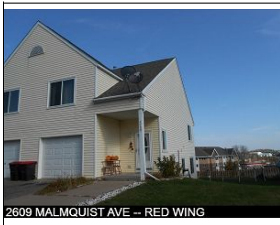
2609 MALMQUIST AVE -- RED WING

PIN: 55.362.0060 Route: 000-000-000 Deedholder: JOSEPH D SOKOLOWSKI Address: 2609 MALMQUIST AVE Map Area: 55 RED WING-R Subdivision: 55362 MALMQUIST HRA ADD Tax District: CITY OF RW 256 Land SF: 43,560 Total Acres: 1.000