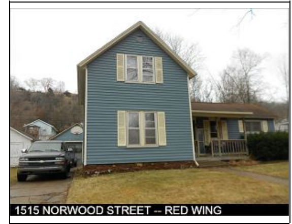
1515 NORWOOD STREET -- RED WING