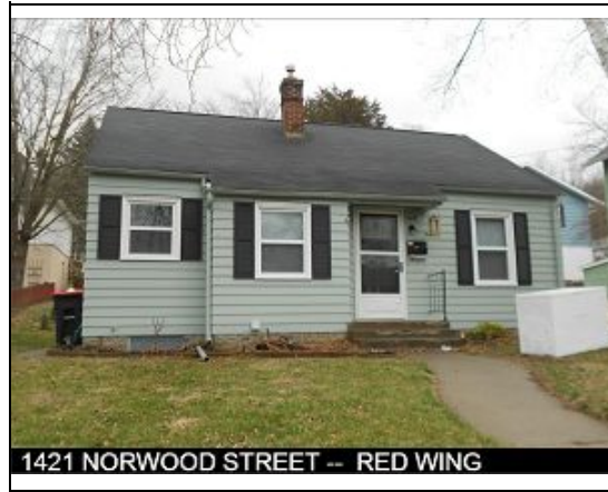
1421 NORWOOD STREET -- RED WING