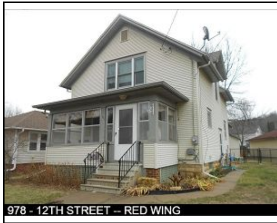
978 - 12TH STREET -- RED WING

PIN: 55.490.0640 Route: 000-000-000 Deedholder: TIMOTHY P KLINGBEIL Address: 645 12TH ST Map Area: 55 RED WING-R Subdivision: 55490 SOUTH SIDE ADD Tax District: CITY OF RW 256 Land SF: 7,877 Total Acres: 0.18