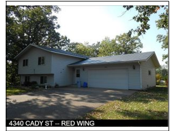
4340 CADY ST -- RED WING