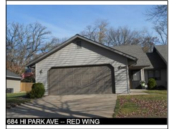
684 HI PARK AVE -- RED WING