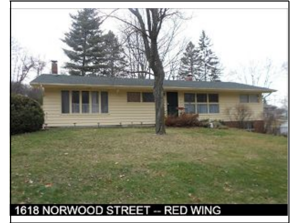
1618 NORWOOD STREET -- RED WING