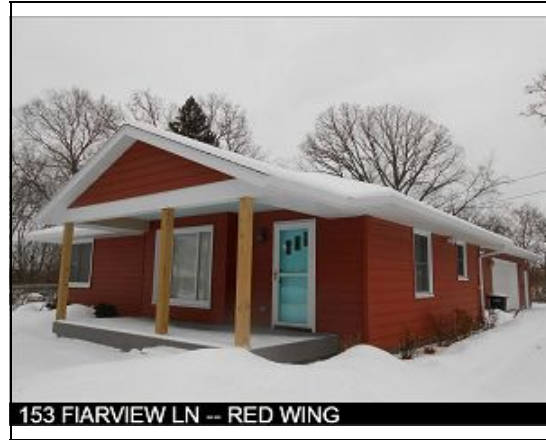
153 FIARVIEW LN -- RED WING