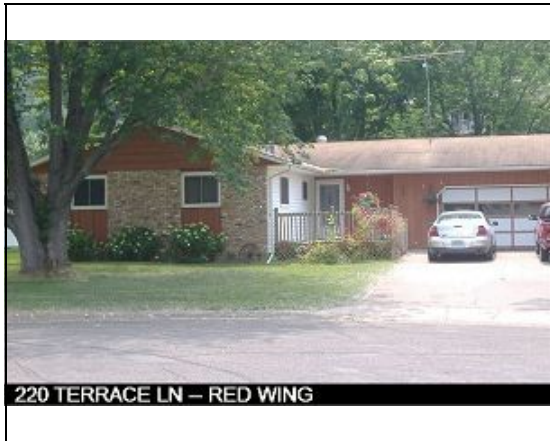
220 TERRACE LN – RED WING

PIN: 55.855.0290 Route: 000-000-000 Deedholder: TERRY O TRI Address: 220 TERRACE LN Map Area: 55 RED WING-R Subdivision: 55855 HIAWATHA HILLS ADD Tax District: CITY OF RW 256 Land SF: 42,023 Total Acres: 0.965