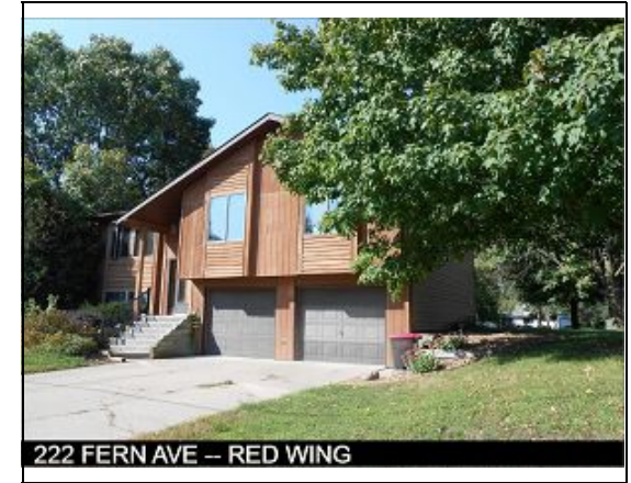
222 FERN AVE -- RED WING