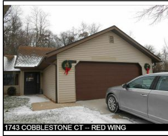
1743 COBBLESTONE CT -- RED WING

Buyer: TODD LANGTON Seller: SCOTT R & LORI L SIMONSON