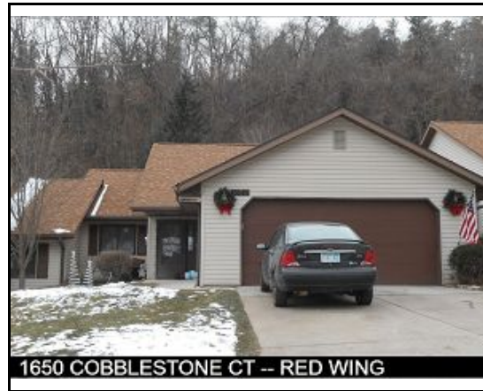
1650 COBBLESTONE CT -- RED WING