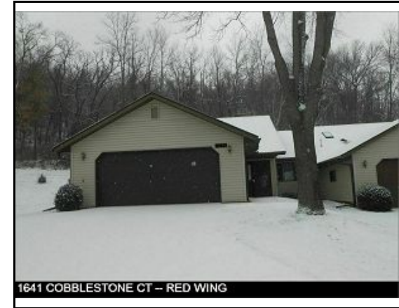
1641 COBBLESTONE CT -- RED WING