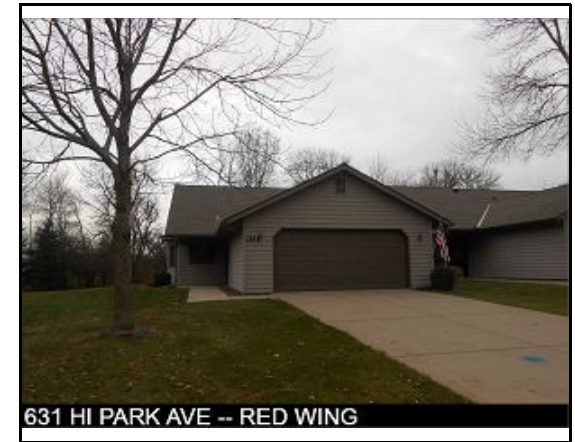
631 HI PARK AVE -- RED WING