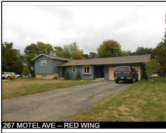
267 MOTEL AVE -- RED WING

PIN: 55.727.0230 Route: 000-000-000 Deedholder: BRYAN L VOGEL Address: 267 MOTEL AVE Map Area: 55 RED WING-R Subdivision: 55727 SECTION 27 Tax District: CITY OF RW 256 Land SF: 12,960 Total Acres: 0.30