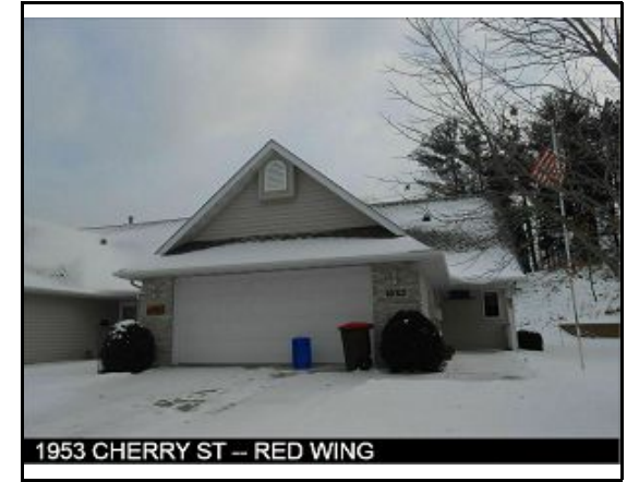
1953 CHERRY ST -- RED WING