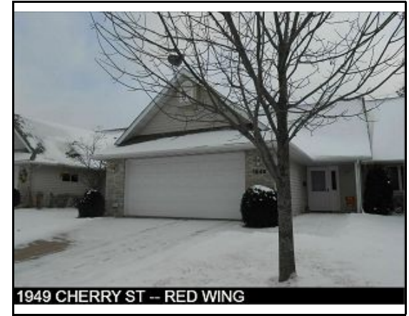
1949 CHERRY ST -- RED WING