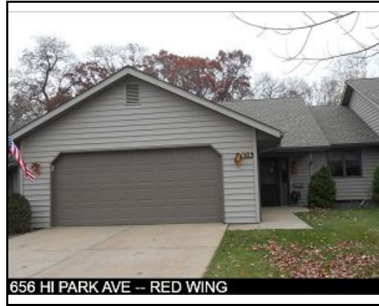
656 HI PARK AVE -- RED WING