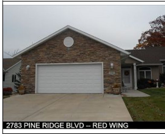
2783 PINE RIDGE BLVD – RED WING