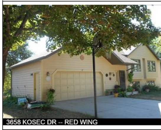
3658 KOSEC DR -- RED WING