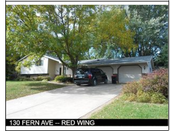
130 FERN AVE -- RED WING