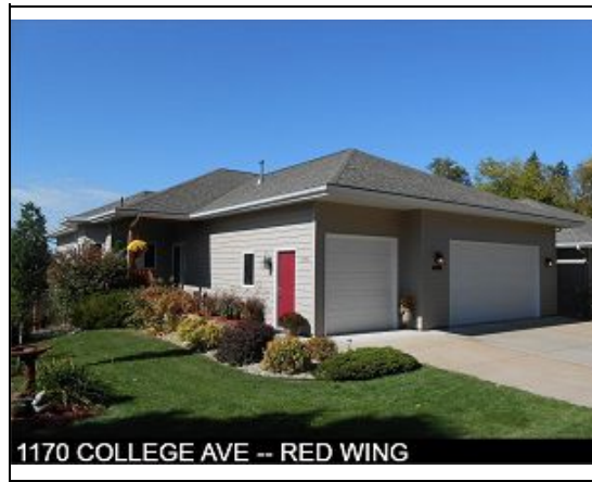
1170 COLLEGE AVE -- RED WING