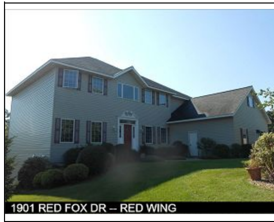
1901 RED FOX DR -- RED WING