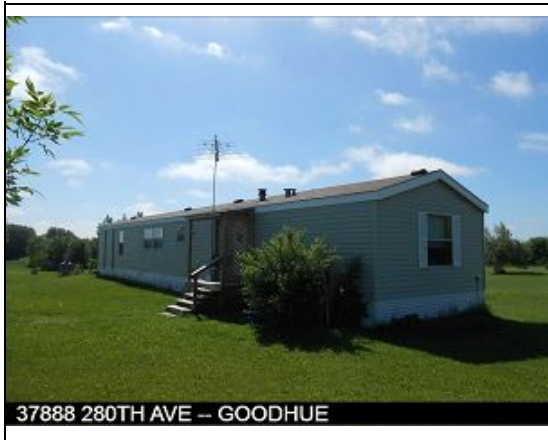
37888 280TH AVE -- GOODHUE